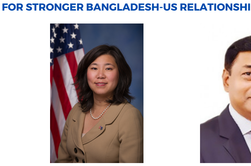
Congresswoman Grace Meng