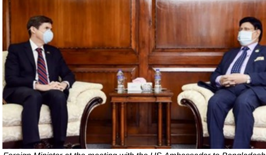
Foreign Minister at the meeting with the US Ambassador to Bangladesh

The Embassy has been in discussion with the U.S. Government to obtain at least 2 million doses of AstraZeneca vaccines from the existing U.S. stockpile to address Bangladesh's immediate vaccination challenge. It has also engaged with the US Chamber of Commerce, and newly established US-Bangladesh Business Council to coordinate both with the US Government and the private sector to meet the country's vaccine needs. The Embassy is deeply engaged with the USAID for assistance in terms of COVID-19 management equipment, particularly the oxygen generator, in addition to vaccines. Bangladesh Ambassador Shahidul Islam urged several Congressmen and Senators and engaging prominent members of Bangladeshi diaspora to voice their support for Bangladesh to help with 2 million AstraZeneca vaccine doses. The Embassy has also established contact with some vaccine producers in the US to explore modalities for possible bilateral cooperation on vaccine supply to Bangladesh. Earlier on 07 May, Foreign Minister Dr. A.K. Abdul Momen MP, at a meeting with US Ambassador to Bangladesh Earl Miller, requested the US government to consider providing 20 million AstraZeneca vaccines to Bangladesh from its stock.